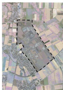
IPAS (Industrie- und Gewerbepark "Am Silberberg")