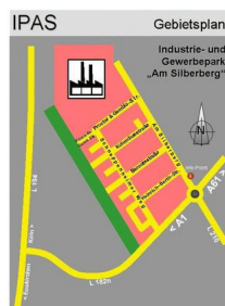
IPAS - Übersicht mit Straßennamen