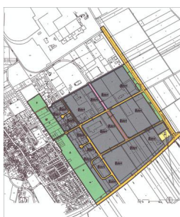
IPAS - Bebauungsplan Nr. 10 (1. Änderung)