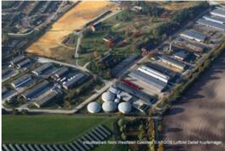
Krampe Fahrzeugbau im Industriepark Nord.Westfalen