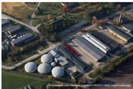
Biogasanlage im Industriepark Nord.Westfalen