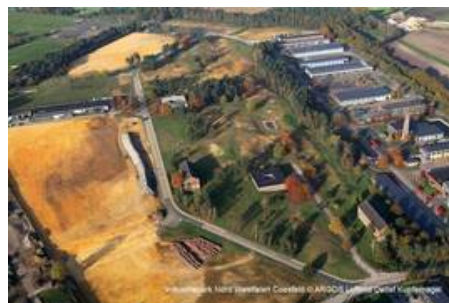
6.3 ha Industriefläche im Industriepark Nord.Westfalen