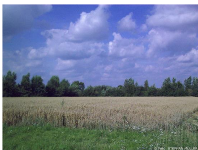
Grundstück neben GLS