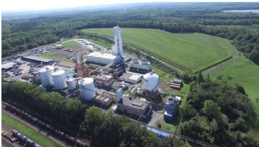
Südweiterung 3 Chemiepark Knapsack.JPG