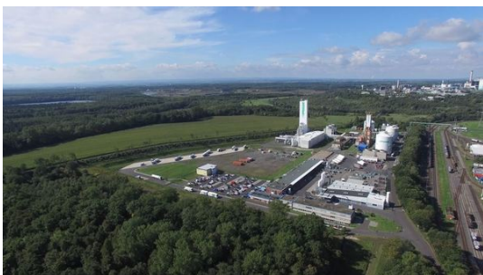
Südweiterung 2 Chemiepark Knapsack.JPG