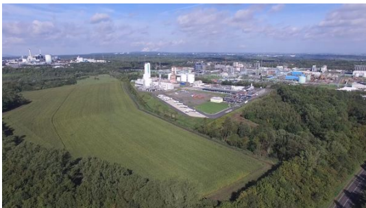
Südweiterung Chemiepark Knapsack.JPG